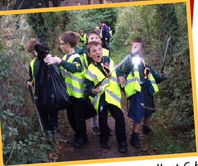
The Scouts managed to collect 6 bin bags of rubbish along Tinpot Lane!